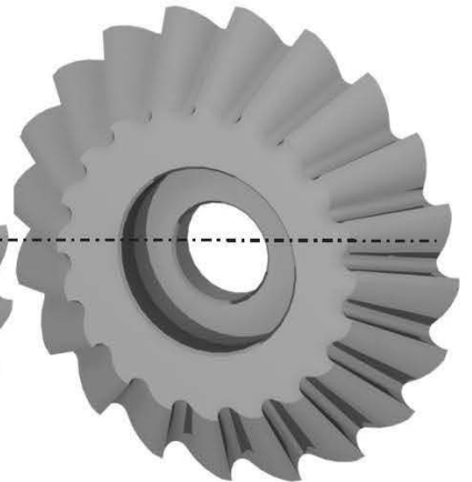
BLADE CONVERSION CHART